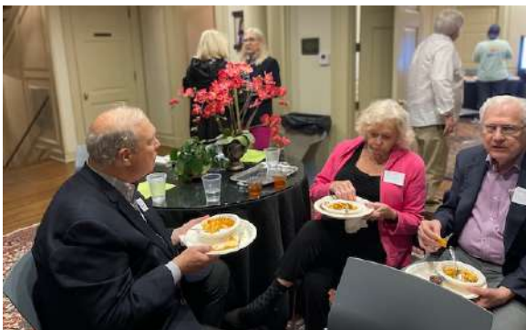
Chili and Charcuterie Party and General Meeting