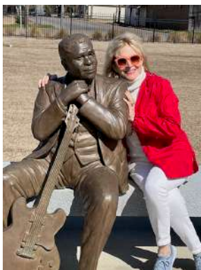
BB King Museum