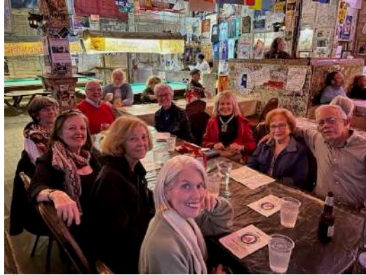
Morgan Freeman's Ground Zero

We then arrived in Jackson, Mississippi for an unforgettable dinner in the lovely restaurant, 1917. The next day we visited the Picasso exhibit at the Mississippi Museum of Art. For lunch, we enjoyed a Mediterranean restaurant, Keifer's, which according to my friend, is the best restaurant in Jackson. We returned home after a tour of the Eudora Welty home. We loved every minute!